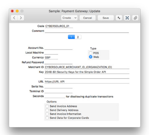
Flip 1 - In field:

Code: input a unique identification code for the payment gateway.